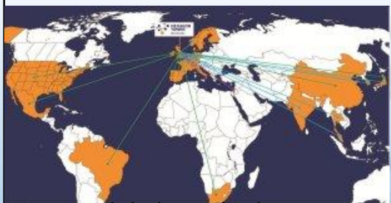
Global supply chain