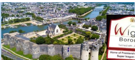
Aerial view of Angers