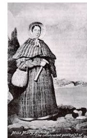
Mary Anning (1799 - 1847)